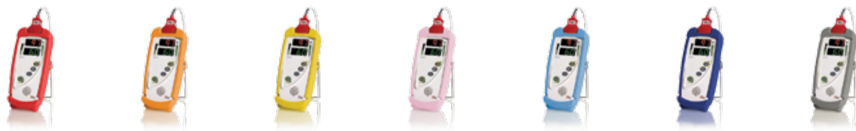
Protective boots are available in your choice of seven different colors.